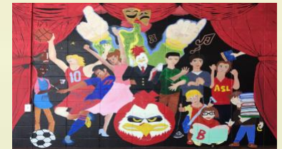
Mural painted by RISD Students

100% of the Proceeds benefit RISDeaf Athletics Fund